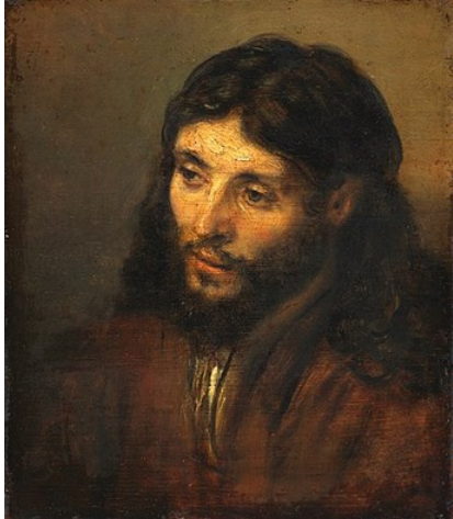
“Head of Christ” by Rembrandt

We’ve illustrated this Lenten series with art from Rembrandt’s Faces of Jesus . Until the time of the seventeenth century artist Rembrandt, most artistic renderings made Jesus look like a Greek god, or a rosy-cheeked cherubic figure. Rembrandt, instead, sought to portray Christ as he more likely really was, and so (enduring criticism for doing so) employed a “Jewish model” from the Jewish quarter of Amsterdam for his dozen or so paintings depicting a “more real” Jesus.