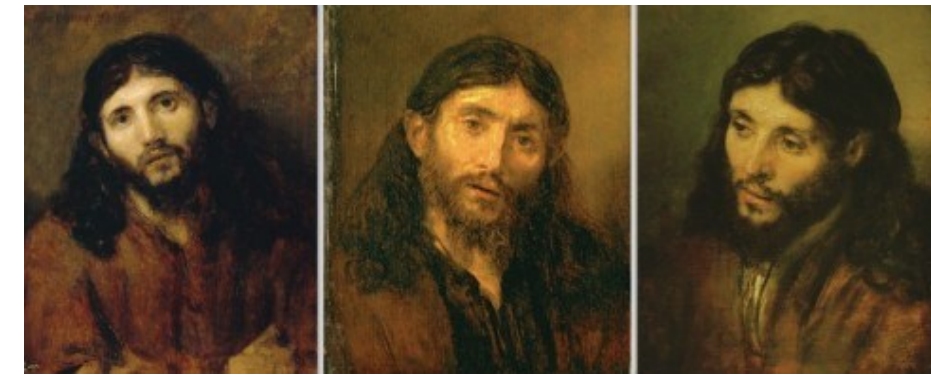
Rembrandt's Faces of Jesus

Lenten Worship with Youth Skits this year will be each Wednesday in Lent at 6:15 - 6:40 pm, preceded by a soup supper served by our youth from 5:30 - 6:15 pm. Worship themes these Wednesdays, and also for other Lent/Easter worship services this year will be The Faces of Christ :