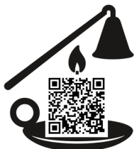
Acolyte Sign Up