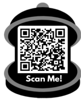
Simple Supper Sign Up